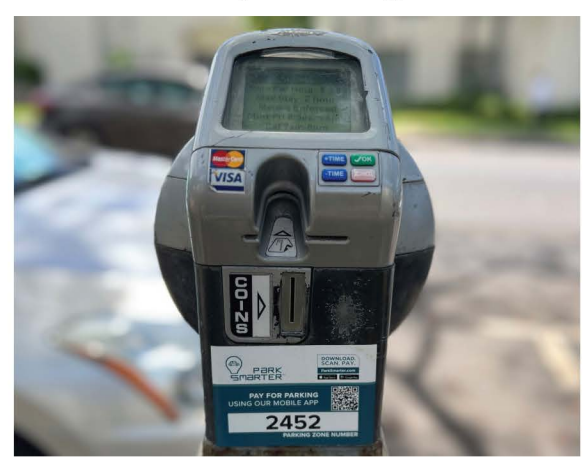
A City Smart Meter with QR code to download Park Smarter Mobile App

Department of Transportation Services (DTS) has recently made strides towards modernizing its parking meters by announcing that approximately 1,700 city parking meters can now accept payment via the smartphone app Park Smarter. The new Park Smarter meters can be found primarily in Honolulu, from Chinatown to Waikīkī.