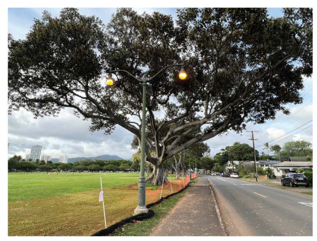
Work on the Kapi'olani Park pathway will begin at Monsarrat Avenue & will progress towards Diamond Head

DPR has announced plans to make improvements to the Kapi'olani Park pedestrian pathway stretching from the Makai-side of Pākī Avenue between Monsarrat Avenue & Poni Moi Road. The project aims to enhance the safety & accessibility of the park's pathways, making it easier for park users to enjoy the park.