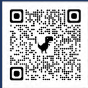
HNL Docs (Council Bill Search)