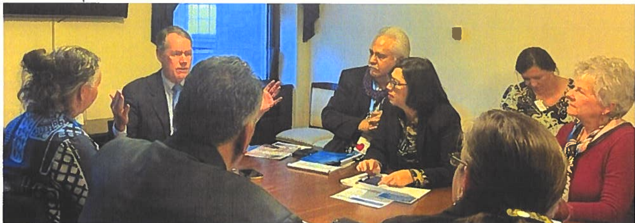
Meeting with Rep. Ed. Case