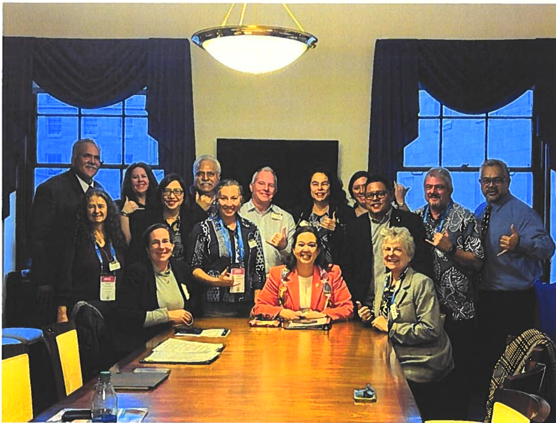
Meeting with Rep. Jill Tokuda