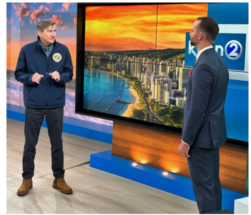
Discussing media transparency with KHON2 news

Reso 24-9, CD1 - Authorizes exemptions from certain City application fees, infrastructure or public works fees and charges, and development standards for the Pāhoia Ridge affordable housing project to be located on Wai'ālae Avenue near the University of Hawai'i at Mānoa.