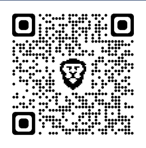
Bill 1 (2024)