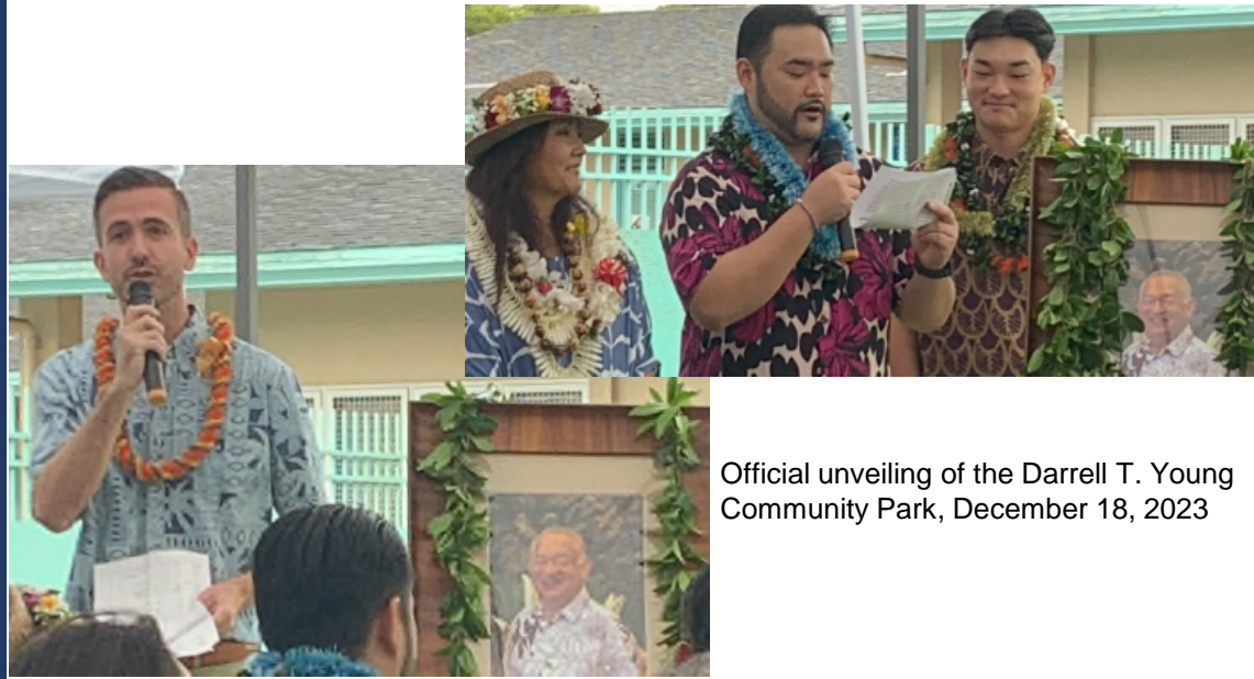
Official unveiling of the Darrell T. Young Community Park, December 18, 2023