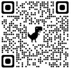
Turtle Bay Scholarship