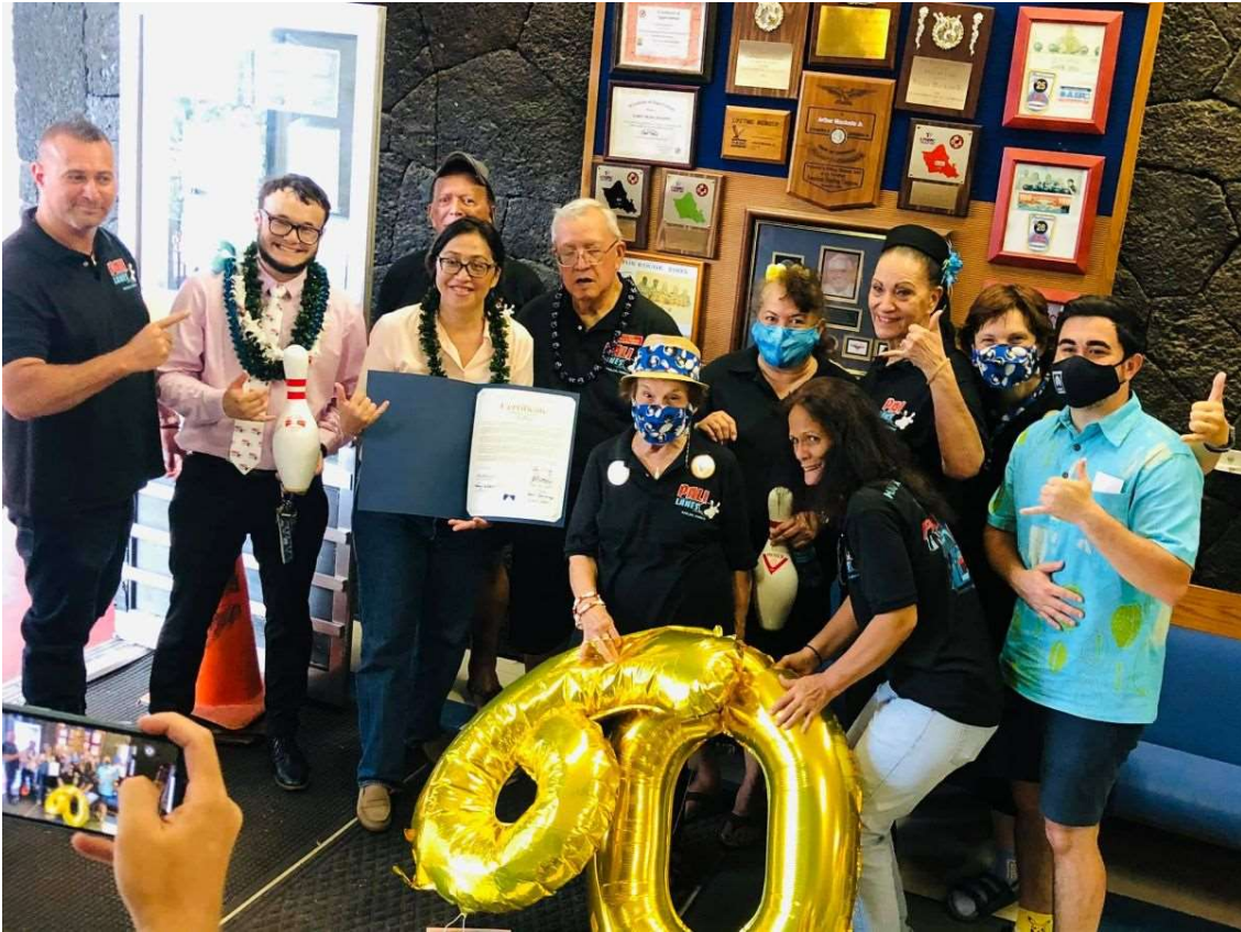
Celebrating 60 years of Pali Lanes serving the community and letting the good times roll!