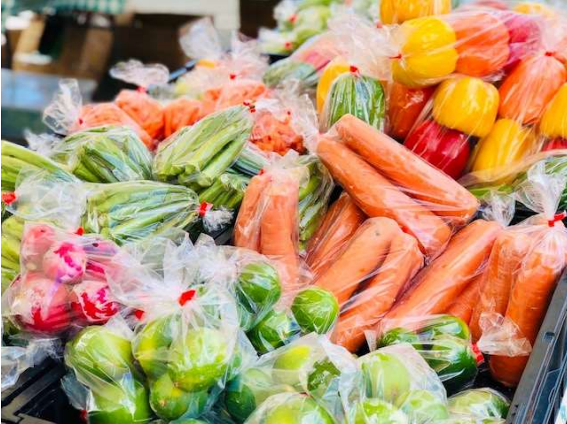
Windward Mall Farmer's Market

I am pleased to announce that my first legislation ( Res 21-079, DC1, FD1 ), urging the Administration to support and expend funds for a grant program to support local agriculture passed the full City Council on May 5 with Administration support.