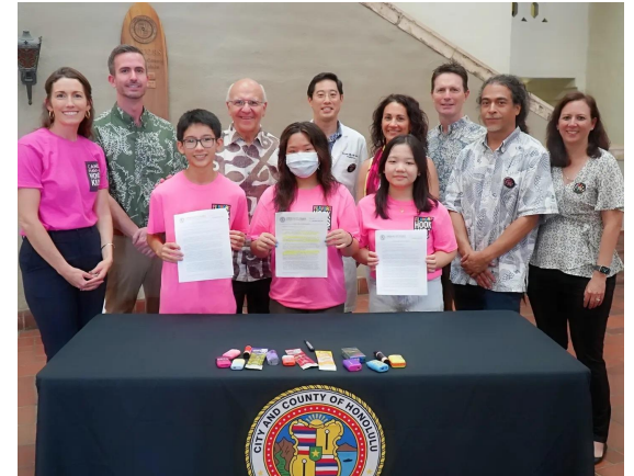
Honolulu City Council Passes Bill 46 (2023)

I am excited to share that Bill 46 (2023), which aims to curb youth tobacco use, has passed third reading at Council and was recently signed by Mayor. Flavored tobacco and nicotine products are particularly attractive to our keiki, with 1 in 3 high school students regularly using electronic cigarettes. In light of this statistic, I co-introduced this measure with Chair Waters, in hopes that this legislation will benefit our youth in Windward O'ahu as well as across our island. I am grateful for the Council and Mayor's leadership, and for the advocacy of our youth and public health advocates that pushed Bill 46 over the finish line.