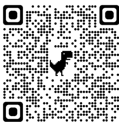
Homeless Info Briefing