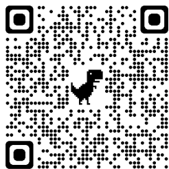
Vote for Honolulu Zoo

This is an amazing honor and is the first time the Honolulu Zoo has been nominated. In order to make the top 10, we need your vote! Anyone 18 years and older can vote once a day from now until March 4 th . Scan the QR Code below and cast your vote today!