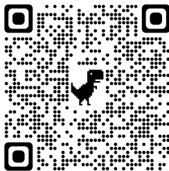
Homeless Info Briefing